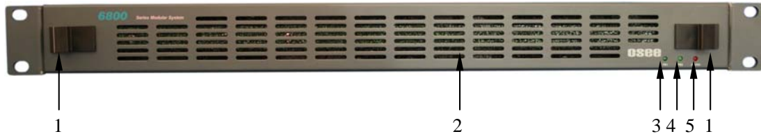
Figure 2-1 the Front Panel of 6800-C1