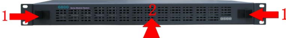
Figure 2-4 Assembly of the front panel

Grab the knobs, push them toward the direction between the two knobs, and push the front panel, then, you can realize the assembly.