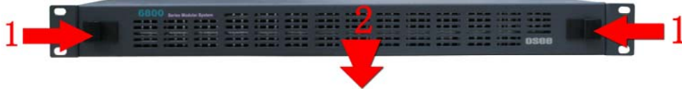
Figure 2-3 Disassembly of the front panel

Grab the knobs, push them toward the direction between the two knobs, and pull the front panel, then, you can realize the disassembly.