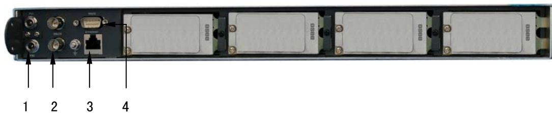
Figure 2-2 the Rear Panel of 6800-C1